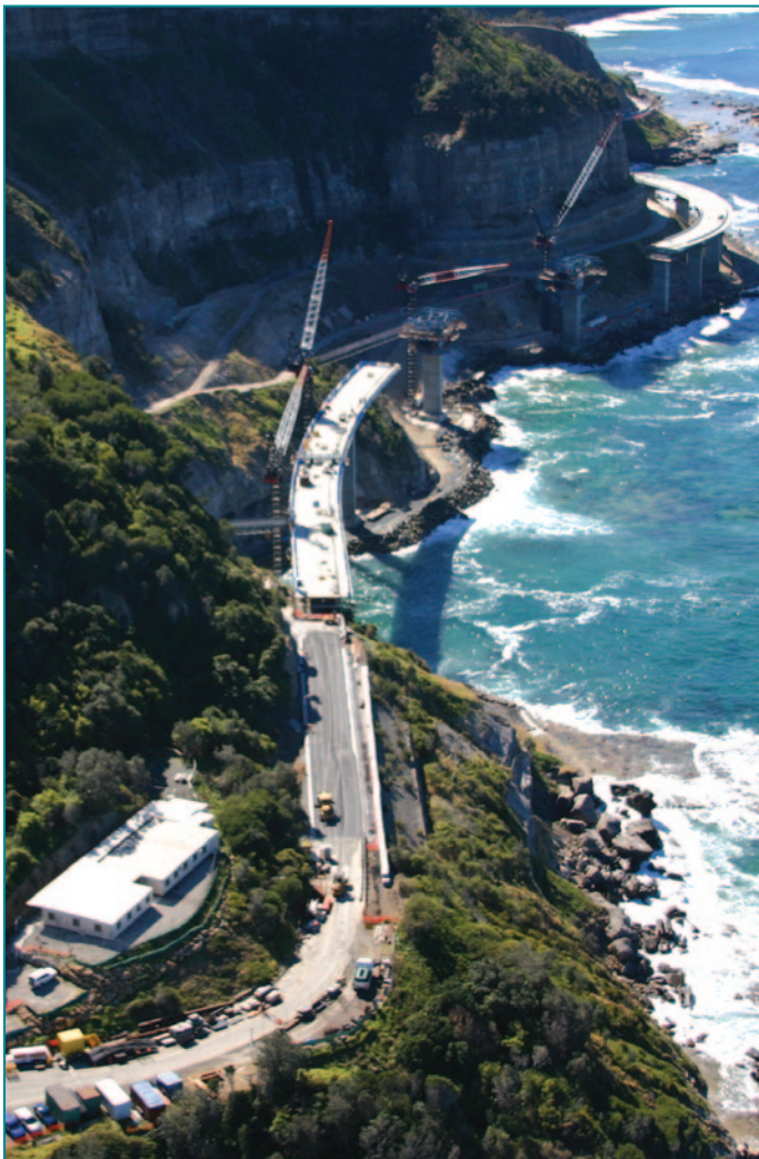
Fig 1: The Sea Cliff Bridge: an award-winning project involving the effective utilisation of Coal Combustion Products.

Fly ash has been used in concrete in construction projects in Australia since the early 1960's (1, 2). Improvements in workability, mix efficiency (with regard to binder optimisation) and improved concrete placement characteristics have largely driven the use of fly ash in concrete since that time (3, 4). Determination of the economically - optimum binder proportion when using fly ash has been undertaken in various ways since that time (5). With the availability of quality fly ashes in Australia, significant benefits have been derived through optimising fly ash contents in concretes. Published examples of this are available in the literature (6). This material has been used to develop concretes that provide efficient solutions to complex design and constructional requirements, examples including concrete for the World Tower building in Sydney, the Q1 Tower on the Gold Coast and many conventional buildings involving both normally reinforced concrete and post-tensioned concrete (7, 8). With the wider availability and use of fly ash, Australian standards for the material and its use in concrete have undergone change and now better reflect the capability of this material.