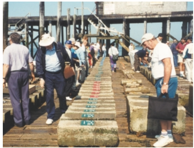
Sea water testing

From an engineering point of view, the chloride level at which steel corrodes at an acceptably low rate is a practical criterion for use in service life prediction. It is suggested that 2(A.cm^{-2}) is a reasonable value to be