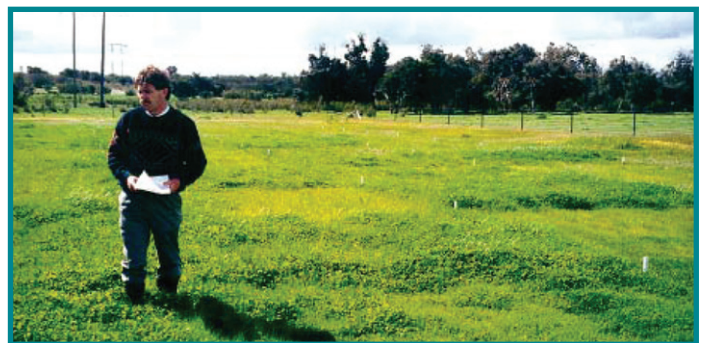
Fig. 1: The Byford, WA test site – Analysis of the improvement of soils with different additions of fly ash and/or fertilizer (Ref. 7).

Some findings from this work are available in the technical literature (7,8). Guides have been produced on assessment criteria for the use of fly ash in agricultural applications.