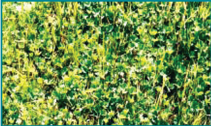
Fig. 2 – Control pasture showing clover growth without soil amendment (Ref. 7)

In general, beneficial elements to plant growth are contributed by fly ash treatments. Toxic levels of trace elements detected are, as a rule, well within required standard levels.