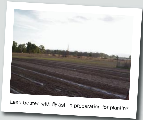
Land treated with fly-ash in preparation for planting

This project holds much promise in developing economic end uses for the more than 13 million metric tonnes of CCP produced in Australia annually. We aim to achieve this in an environmentally sustainable manner that would engender routine use of CCP as a substitute to agricultural lime and/or gypsum, wherever appropriate. >