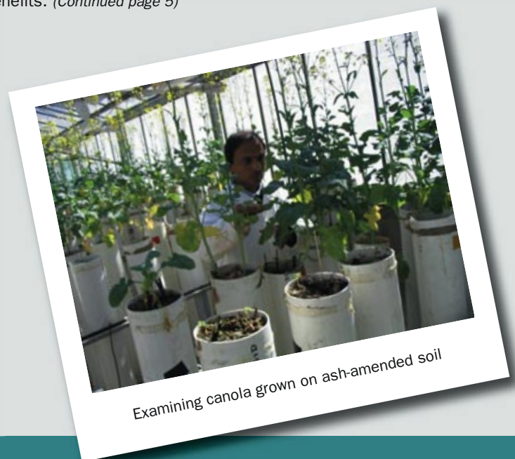
Examining canola grown on ash-amended soil

For the past two years, researchers at the UTS's IWERM have been working to understand how fly ash may be employed to improve productivity of a range of agricultural soils, and to assess any environmental impacts and benefits. (Continued page 5)