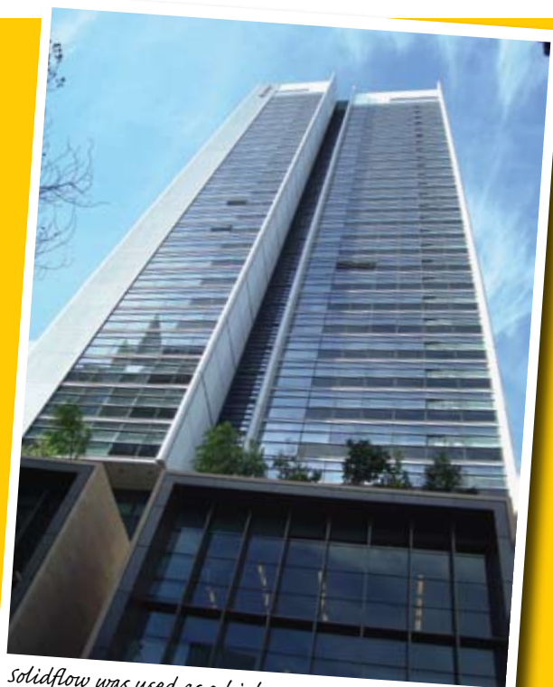
Solidflow was used as a high strength concrete additive in the Regent Place development, Sydney