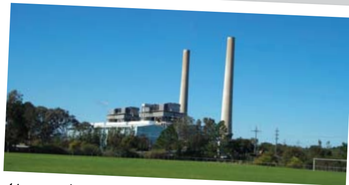
Munmorah Power Station

Extensive testing has shown that Munmorah's Zone 2 fly ash gave excellent performance in concrete and was marketed as "secondary fly ash". Zone 1 fly ash was marketed mainly for non-concrete uses as "primary fly ash".