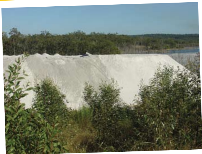
A furnace bottom ash emplacement at Tarong North Power Station.

The success of these efforts has resulted in the saving of over 20,000 tonnes of natural sand for other uses and with the superior properties of furnace bottom ash, should result in better pipe support and protection over the years.