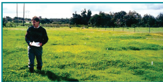
Fig. 1: The Byford, WA test site – Analysis of the improvement of soils with different additions of fly ash and/or fertilizer (Ref. 7).

Some findings from this work are available in the technical literature (7,8). Guides have been produced on assessment criteria for the use of fly ash in agricultural applications.