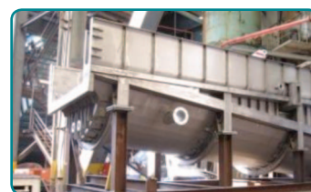
New Ash Hopper Section

The ash hopper replacement project successfully managed the design, construction and installation phases of the work. Installation activity was particularly challenging, given the requirement to manage key interface areas both on the bottom of the boiler and in the surrounding milling plant area.